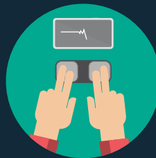
Patient initiated (or medical professional) intermittent ECG rhythm strip using smartphone or dedicated connectable device