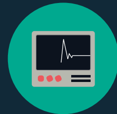
In hospital telemetry monitoring